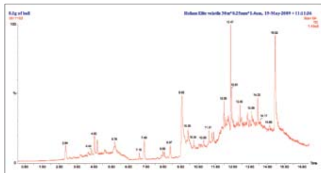
Figure 2. Total ion chromatogram of 0.1 g of toy-ball sample.

Following the calibration of the system, 4 toy samples (toy ball, noise putty, modeling compound, crab) obtained from the local market were analyzed. The resultant chromatogram for the analysis of the toy-ball sample is pictured in Figure 2. The sample preparation with headspace analysis is very simple.