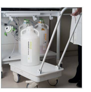
Hands-on convenience The new instrument table and optional trolley for bulk liquid bottles make for a lighter workload.