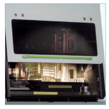
Laboratory friendly The front lid moves up instead of out for better movability in the laboratory. LED lights inside improve visibility.