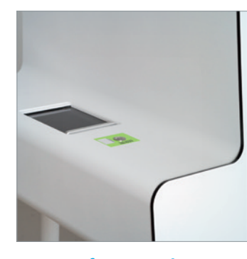
Safer screening New enclosed plate loading minimizes the risk of contamination.