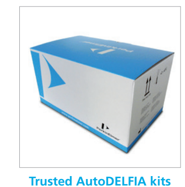
The AutoDELFIA kit includes reagents, QC material and specific QC certificates. Barcoded plates confirm that plates are loaded in correct order, and worklists are picked up based on the plate barcode.