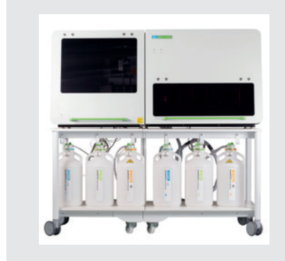
Optional Sample Processor AutoDELFIA can be equipped

Worklists from the punching device can be interpreted automatically, and positive sample IDs are provided for superior traceability if using barcoded sample collections cards.