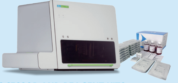
PLATE PROCESSOR AND REAGENT KITS

The AutoDELFIA Plate Processor is an immunoassay system widely used in newborn screening laboratories. The new AutoDELFIA uses the same proven kits as before for screening of some of the most common neonatal screening disorders. The processor performs all assay stages and measurement automatically.